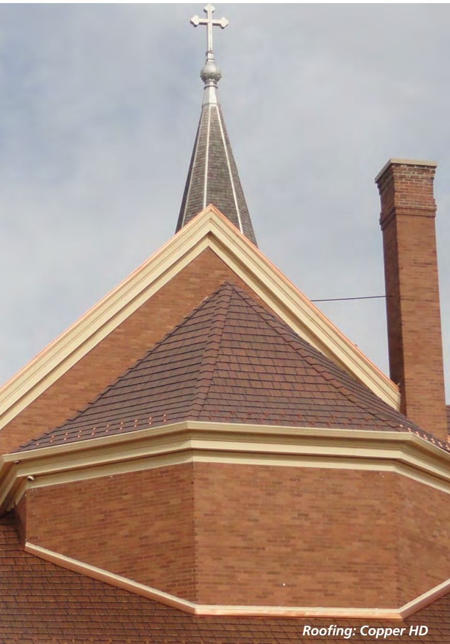
Roofing: Copper HD