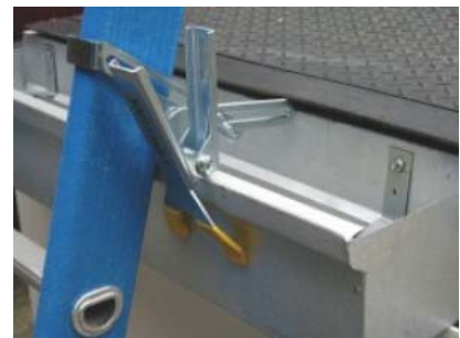
Mt. Everest Safety Products