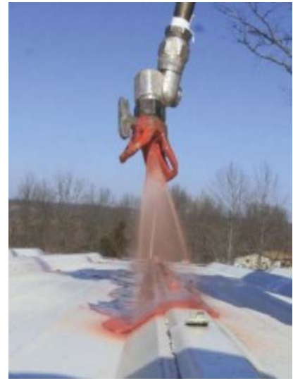
Iron Sentry's Polyurethane sealer is applied to seams, holes and fasteners. The sealer cannot be penetrated by oxygen and water, even as it expands and contracts with the weather. It also is non-toxic: it contains no mercury.