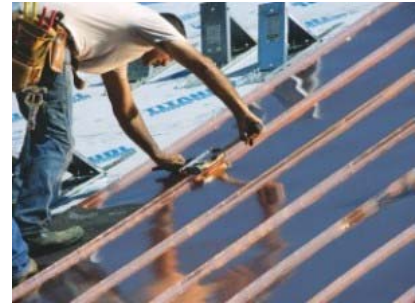
Engineered Materials Solutions