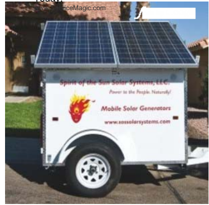
SOS Solar Systems