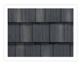
Infiniti Textured Shake in Granite Gray Enhanced